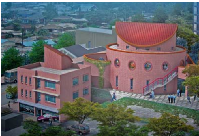
The two new buildings at Incheon.

Australian Augustinians have been serving in Korea since the Order first went there twenty years ago.