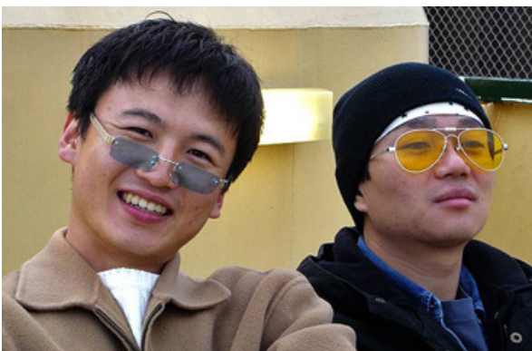
Two Korean students who visited Australia for two months this year to study English.