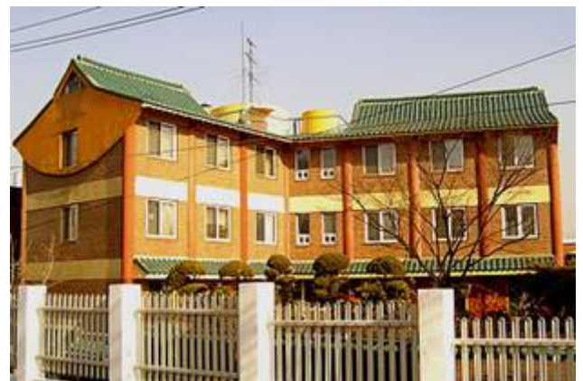
Augustinian Priory—Incheon, South Korea