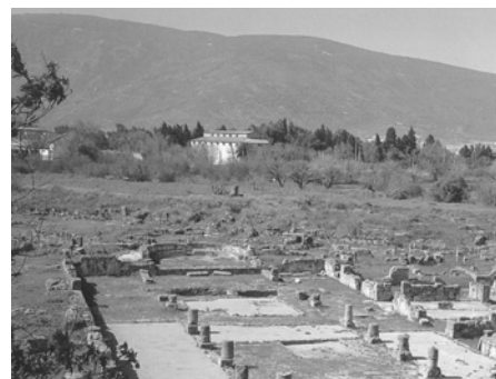
Excavations of Basilica Pacis, Hippo, where St Augustine was bishop (now Annaba, Algeria)