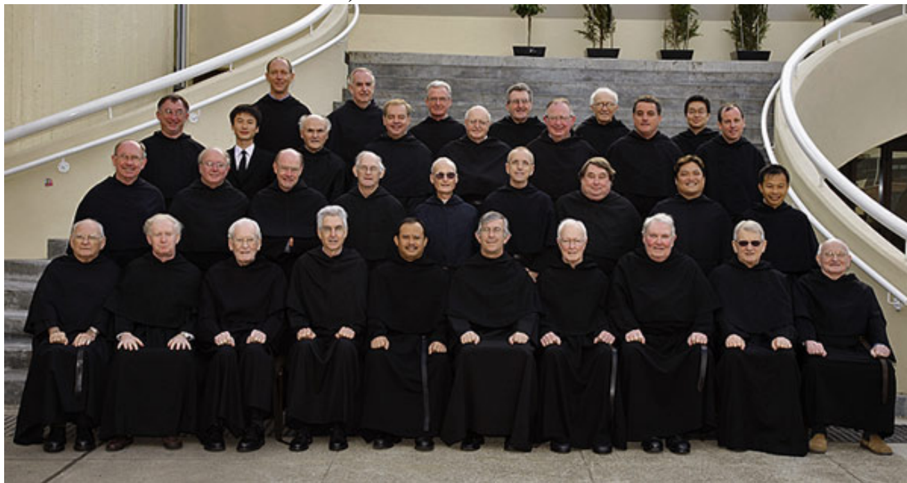
Brimson Centre, St Augustine's College, Brookvale 25th June—30th June 2006